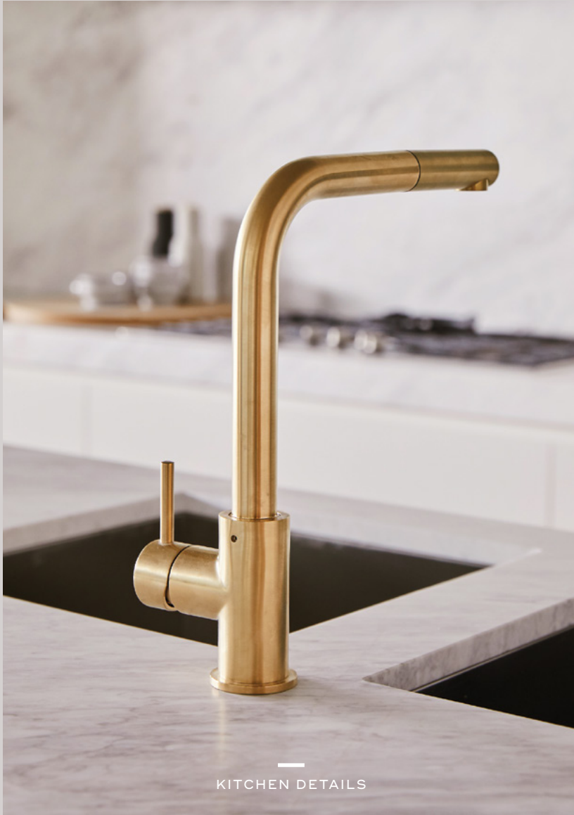
— KITCHEN DETAILS