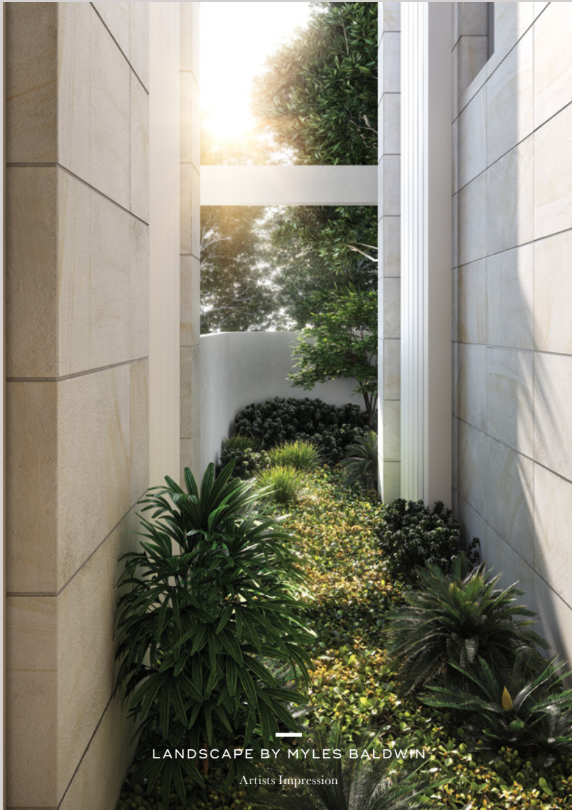
LANDSCAPE BY MYLES BALDWIN Artists Impression