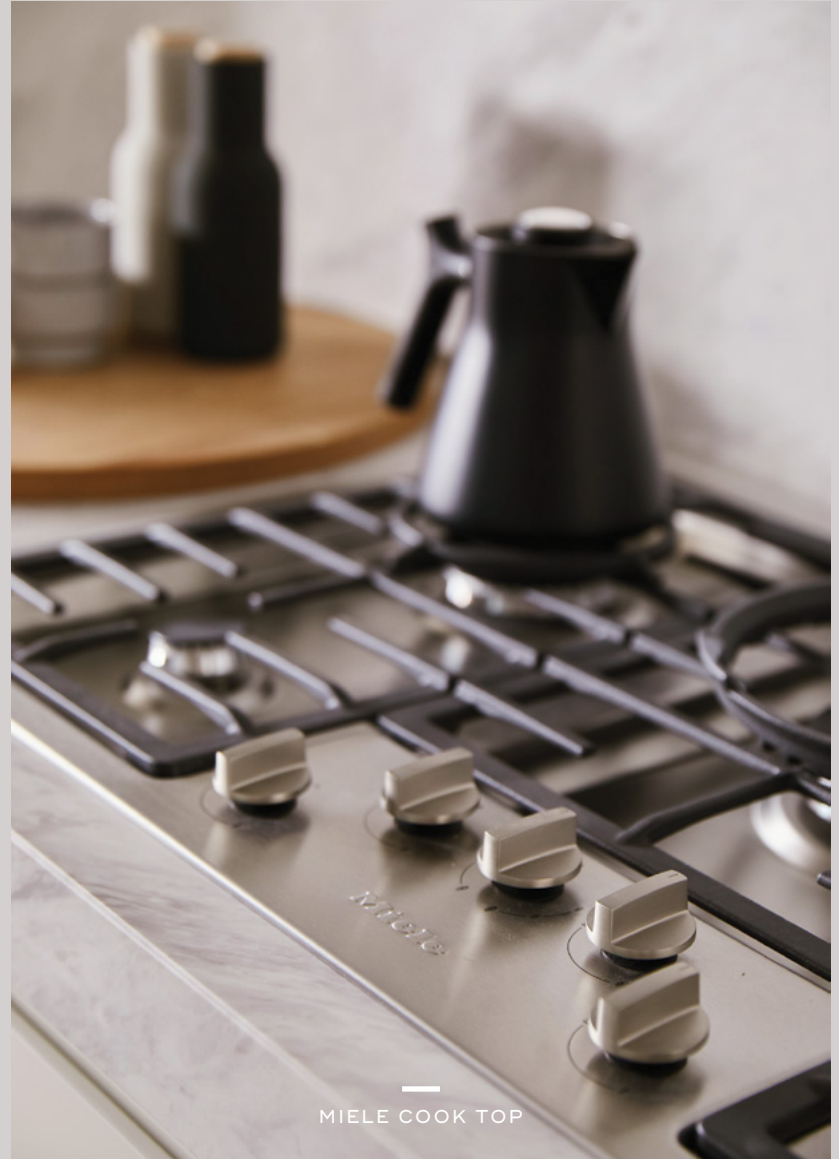
— MIELE COOK TOP