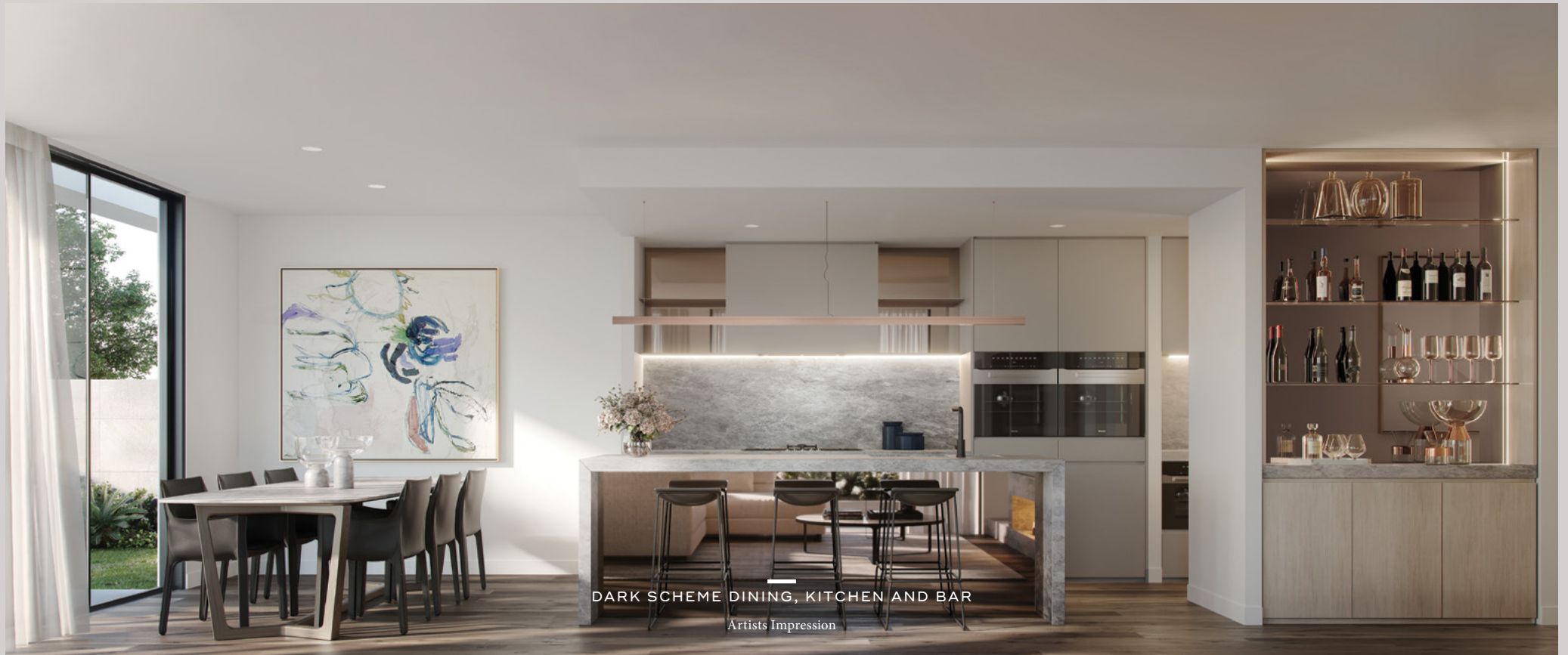
DARK SCHEME DINING, KITCHEN AND BAR Artists Impression