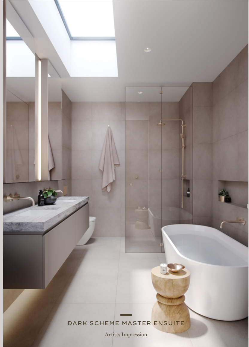
DARK SCHEME MASTER ENSUITE