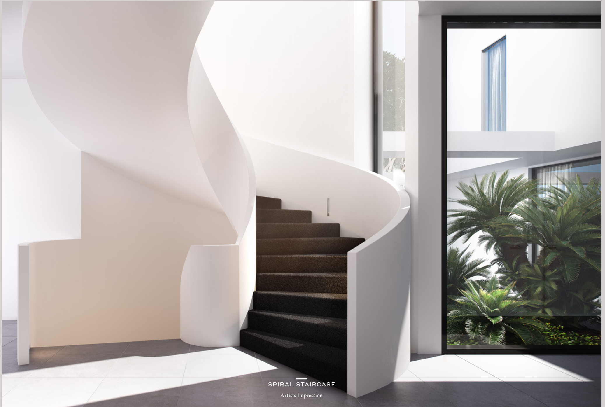
— SPIRAL STAIRCASE Artists Impression